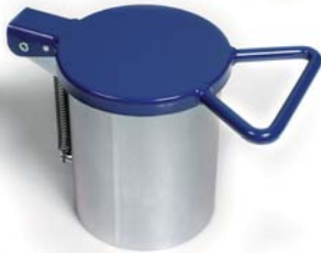
Tella Suction Outlet blue 108

Suction Outlet, Tella original, self closing, blue. Diameter 76 mm.