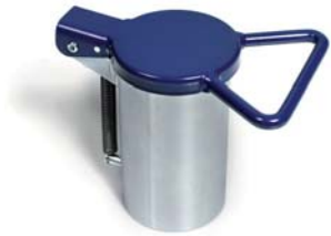
Tella Suction Outlet blue 76