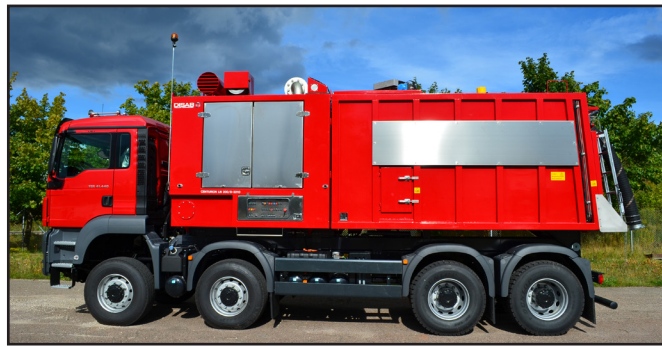
(This unit is equipped with options)