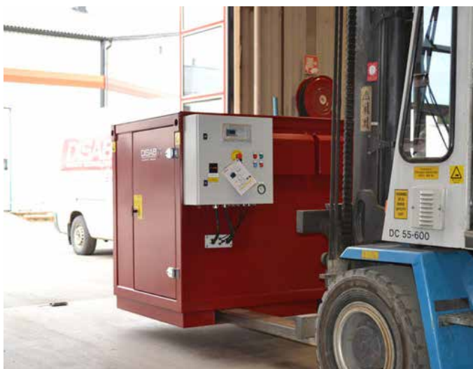
The DISAB PES-2S comes with a complete control cabinet, which includes all equipment for easy use. With the help of the built-in fork aisles and lifting loops, you can easily move the vacuum unit, using a forklift or crane.

DISAB vacuum unit PES-2S is designed for stationary installations and shall always be connected to a filter separator to make a complete vacuum system.