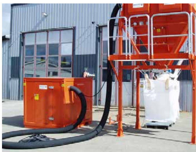
DISAB PES-5 units are a series of complete standalone vacuum units, intended for use with one of our filter separators.

PES- 5 meets the high demands from the industry due to its efficiency, reliability, ease of operation and maintenance giving excellent value for money.